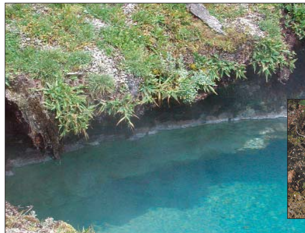
Hot stuff. Fungi living inside this grass make life near thermal springs, where soils can be 60°C, tolerable.

The food plants became much more tolerant of harsh conditions, the researchers reported at the meeting. Watermelon and tomatoes whose roots would barely